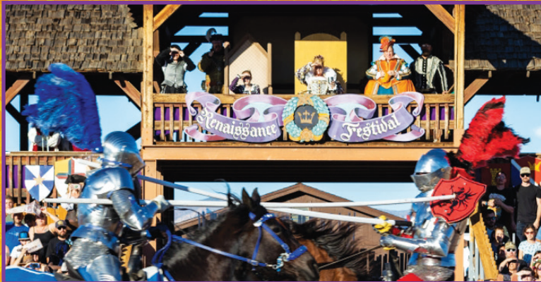
Cheer for your favorite knight!