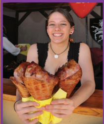
All day feasting!

FEBRUARY 3-MARCH 31 SATURDAYS, SUNDAYS & PRESIDENTS' DAY • 10AM-6PM