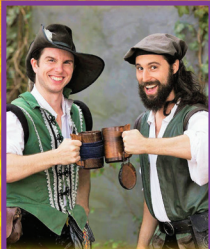
NEW! Pub Crawl!