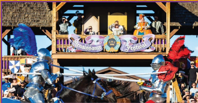
Cheer for your favorite knight!